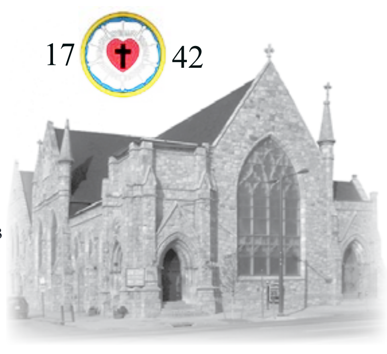
"Also laßt euer Licht leuchten vor den Leuten, daß sie eure guten Werke sehen und euren Vater im Himmel preisen."

"Let your light so shine before men, that they may see your good works and glorify your Father in heaven.".